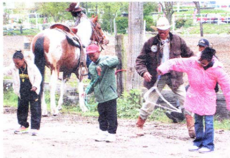
History of the black cowboy comes alive in Howard Beach.